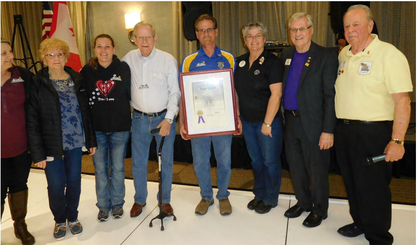
ROCK COUMMITY LIONS CLUB TRIVA NIGHT and CLUB CHARTER PRESENTATION