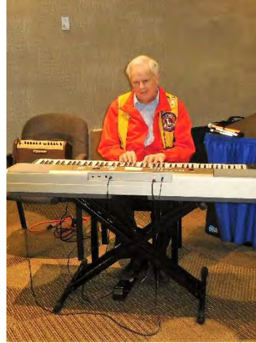
Lions Clubs and Individuals Honored with Prestigious Award